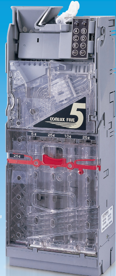
CCM5G Series Five-Tube Changer